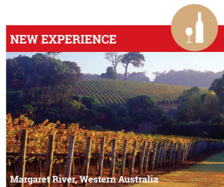
Margaret River, Western Australia