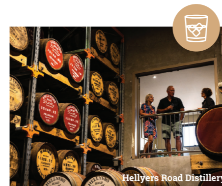
Hellyers Road Distillery