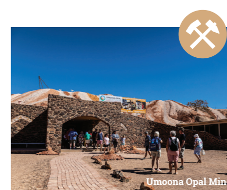
Umoona Opal Mine