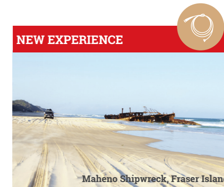
Maheno Shipwreck, Fraser Island