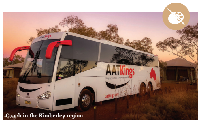
Coach in the Kimberley region