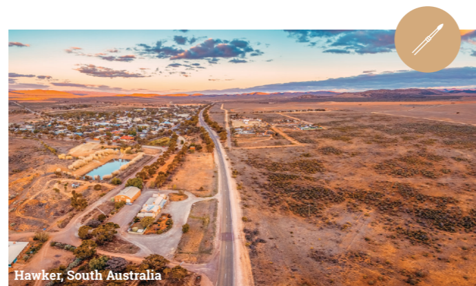
Hawker, South Australia

Meet the artists on: WBD / WDB / WDBP / WPBD