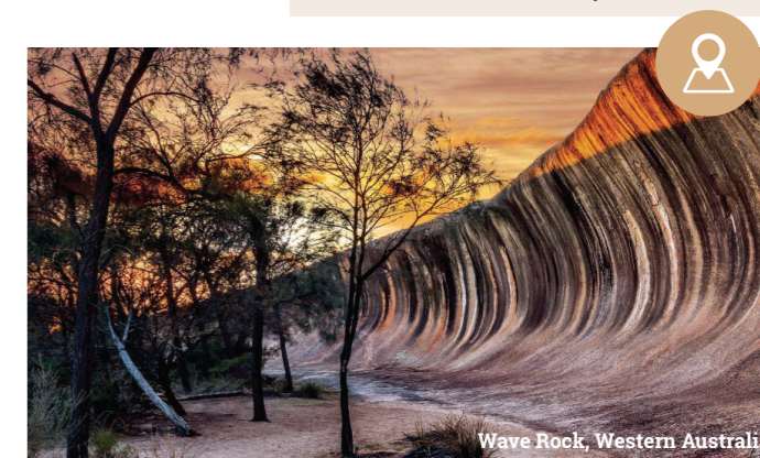
Wave Rock, Western Australia