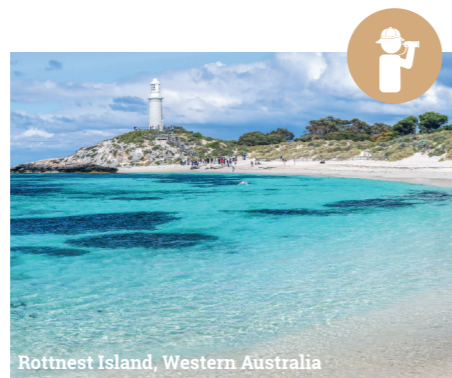
Rottneest Island, Western Australia