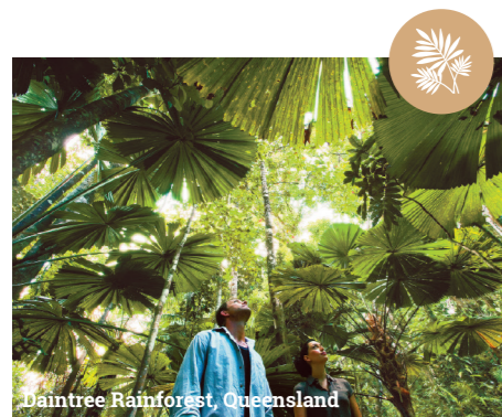
Daintree Rainforest, Queensland